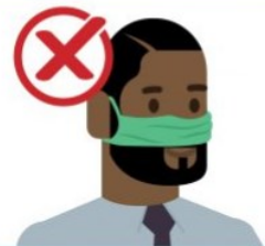
Only on your nose