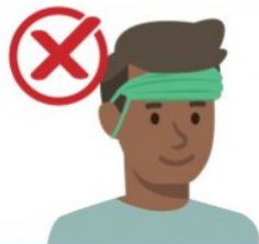
On your forehead