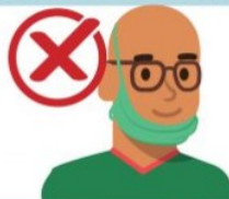
On your chin