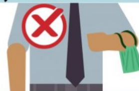
On your arm

Wearing a mask any way other than in the manner described above is like not wearing a mask at all.