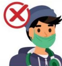
Under your nose