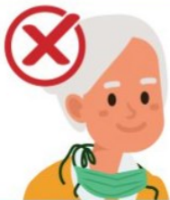
Around your neck