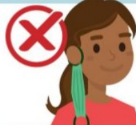
Dangling from one ear